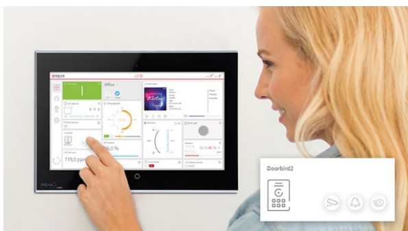
Enhanced door station module in YOUVI visualisation