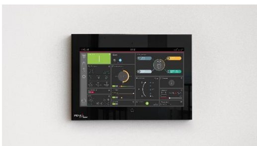
Energy management in the smart home with YOUVI visualisation