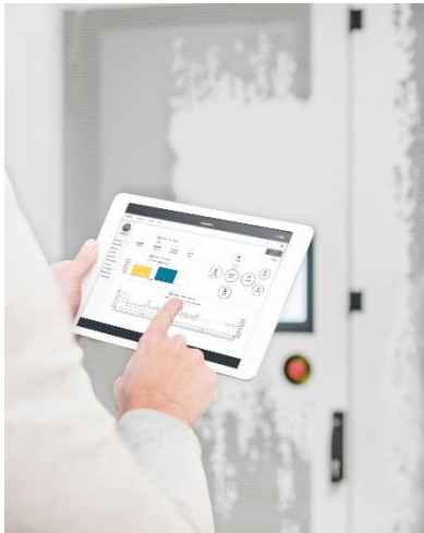
Using NTUITY via tablet