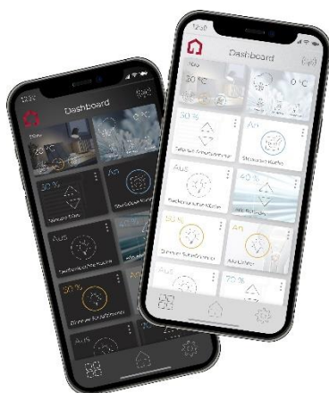
YOUVI Mobile App in dark and bright design