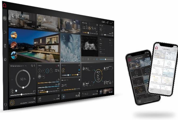
YOUVI 5.0 for KNX touchpanels and smartphones

Please note that these photos are for preview purposes only. For your publications, please use the photos under this download link .